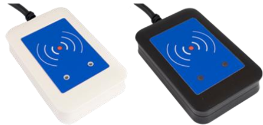
Desktop version (inlay customizable)

Elatec's TWN4 family of transponder readers and writers allows users to read and write to almost any 125 kHz, 134.2 kHz and 13.56 MHz tags and/or labels – it supports all major transponders from various suppliers like ATMEL, EM, ST, NXP, TI, HID, LEGIC, etc. and ISO standards like ISO14443A/B (T=CL), ISO15693, ISO18092 / ECMA-340 (NFC).